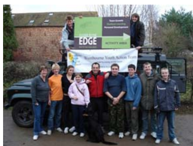
WYAT Members attended several training residentials.

On the 23 rd to 25 th of November WYAT went on a training residential, staying five minutes from Bridgnorth. We arrived on the Friday night at 7.30 pm.